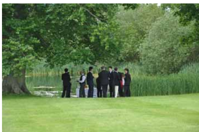
Guests enjoying refreshments in the gardens