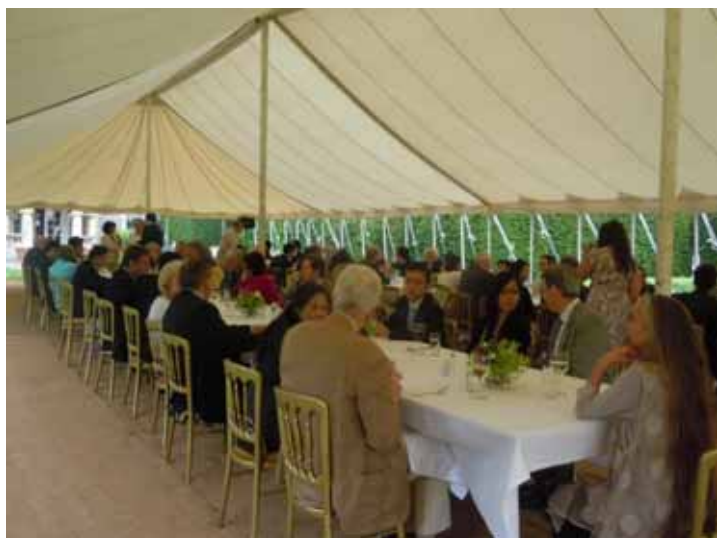
Guests enjoying the luncheon under the marquee