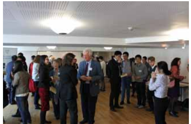
Refreshment break in the Presentation Room