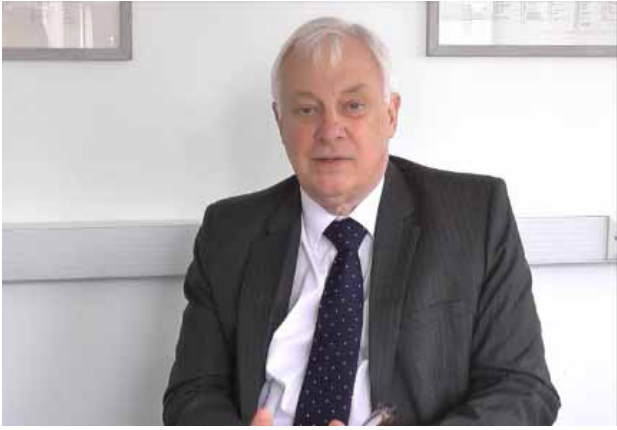
Lord Patten welcomes guests via video