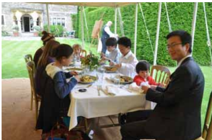
The guests included a few children too!