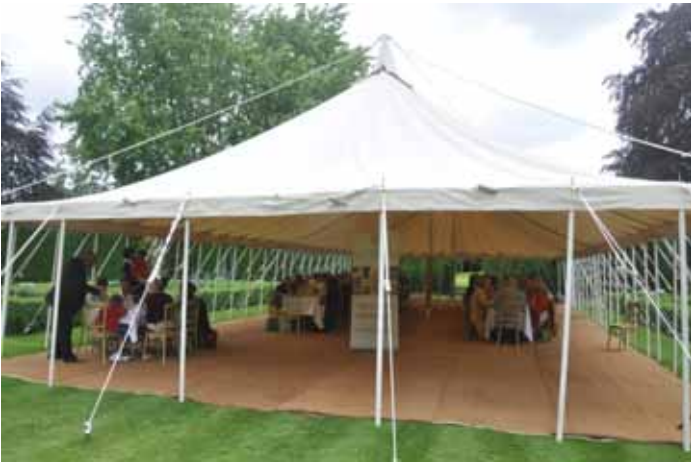
Guests enjoy the summer lunch under a marquee