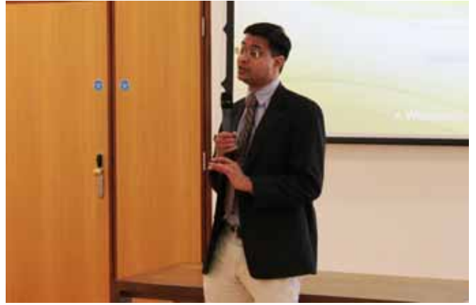
Guest speaker Prof. Rana Mitter