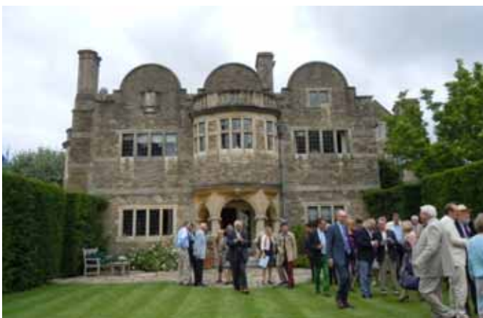
.Guests mingling in one of the gardens