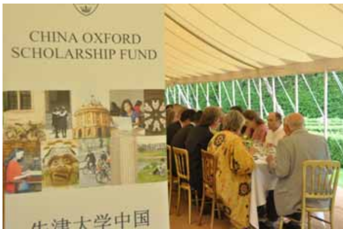
Guests enjoying their 2-course lunch