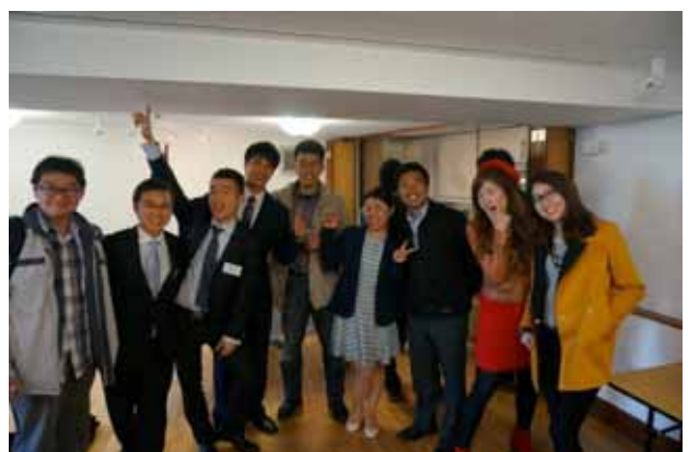
Celebrating the end of a successful conference