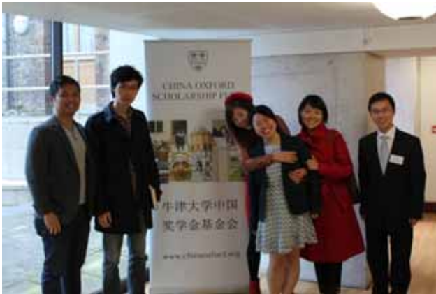
Friends show their support for the Scholars