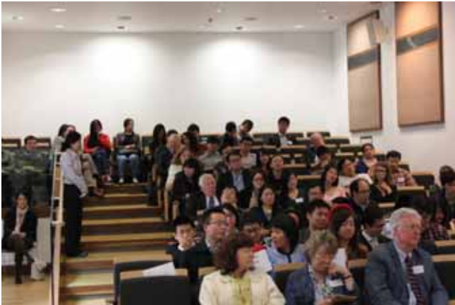
Christ Church's Blue Boar Lecture Theatre