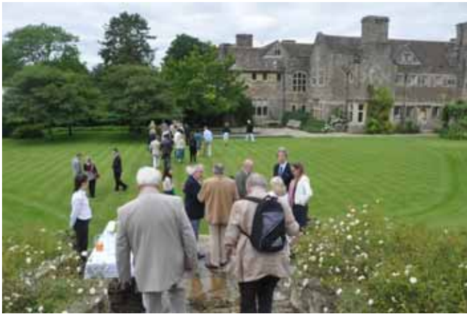
Guests enjoy refreshments in the gardens