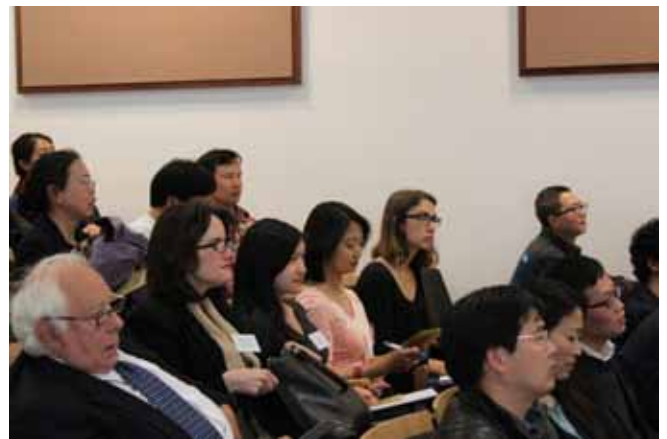
Q & A session with guests