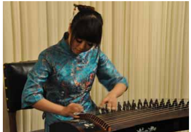
The London Confucius Institute provided the evening's musical entertainment