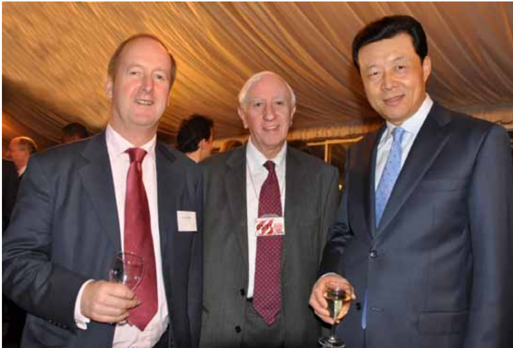
(L-R) The Rt Hon the Lord Northbrook, the Rt Hon the Lord Cotter and His Excellency Chinese Ambassador Liu Xiaoming

The Year of the Rabbit was celebrated in Parliament with China's Ambassador, His Excellency Liu Xiaoming, as the special guest of honour. Ambassador Liu made a toast to a happy new year and stronger bilateral ties between China and the Britain to the nearly 200 guests who were on hand for the Annual Terrace Reception organised by the All Party Parliamentary China Group (APPCG). The evening reception took place on the 1st of February and was hosted by the APPCG's Chairman the Hon. Mark Hendrick MP with the Minister of State the Hon. Jeremy Browne MP also as a special guest. The Minister spoke of the benefits of the 85,000 Chinese students studying in the United Kingdom and he expressed his hope that perhaps just as many British students could one day study in the People's Republic of China. Ambassador Liu added that such people to people contact should not be underestimated in strengthening ties between the two countries and that he would like to see educational exchanges grow stronger for years to come. He added it would be his hope for China's iconic pandas, or at least a pair of them, would be able to call Britain their home in the near future to reflect this bond.