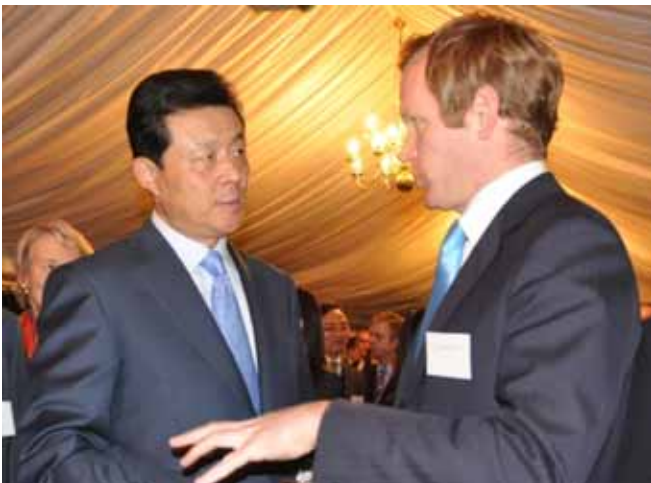
H.E. Ambassador Liu and the Minister of State the Hon Jeremy Browne MP