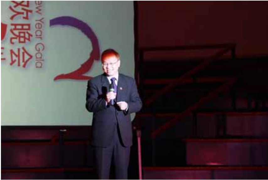
Chinese Embassy Minister Counsellor for Education Tian Xiaogang