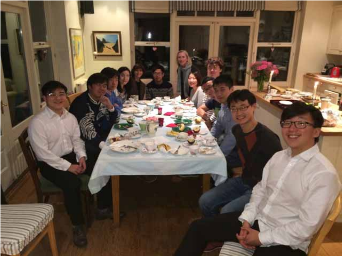
2015 Scholars enjoy a traditional British afternoon tea in Oxfordshire