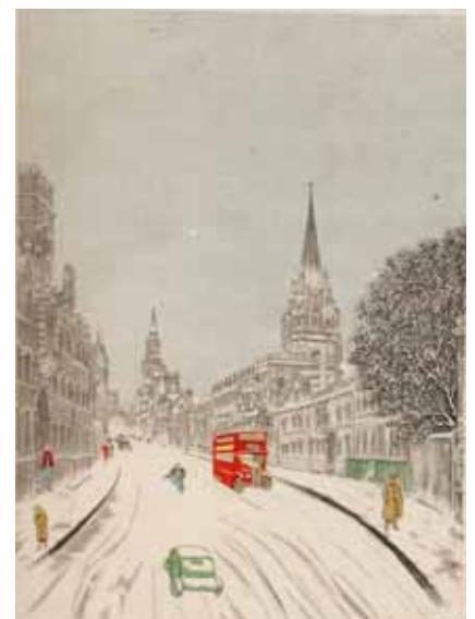
Oxford High Street in Winter by scholar Chiang Yee (1903-1977) in his book The Silent Traveller in Oxford which was published in 1944