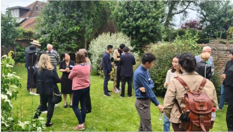
Guests were also able to enjoy Lord and Lady Patten's beautiful garden at their Oxford home.